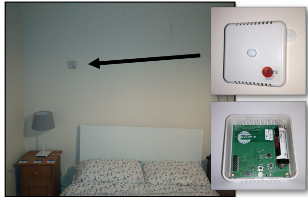
Figure 1. The SPHERE Environmental Sensor (SPES-2) deployed in a terrace-house in the city of Bristol, UK.

Residential monitoring using low-power sensing technology will play a key role in the future of healthcare provision, as national health systems face serious economic challenges due to the ageing of the population and the rise of incurable chronic illness. In this context, the vision of SPHERE (Sensor Platform for HEalthcare in Residential Environment) is to develop a multipurpose, multi-modal platform of home sensors, that would facilitate residential healthcare through learning the routines of the residents, identify suspicious abnormalities, and facilitate timely interventions [8]. The SPHERE platform is based on three sensing technologies: a Body Sensor Network made up of ultra low-power wearable sensors [5]; a Video Sensor Network focusing on recognition of activities through video analysis [6]; and an Environ-