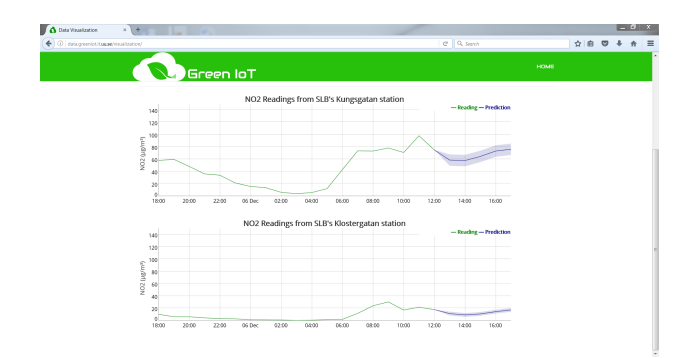
Figure 2: The web page visualizes the air pollution level forecast results for the next 5 hours.

If the sensor has not been maintained properly (e.g., calibration), then readings received from this sensor will be discard until it is repaired. Secondly we check the value of a reading and will discarded it if the value is obviously incorrect (e.g., readings out of possible data range).