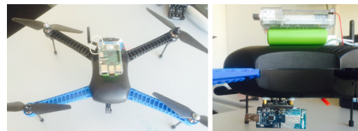
Figure 2. The repairing agent: the Iris+ drone carries the Pi on top and the EPM (with a sensor node) at bottom.

We build our prototype for the repairing agent combining a Raspberry Pi model B+, a Raspbee radio module, an EPM device (electromagnet permanent device) and an Iris+ drone.