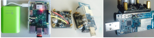
Figure 3. Left: A Pi with a Raspbee. Middle: An EPM device and a Tmote sky (attached with a metal plate). Right: the EPM holding a sensor node with its magnets.

For picking up, carrying and dropping a new node in repairing the network, we use the EPM device (Figure 3). The EPM device, which connects to the Pi via the GPIO on the Pi, draws the power from there and also receives on/off commands from the Pi for magnetising/demagnetising its magnets to hold/release a new sensor node (for picking up/dropping down a sensor node).